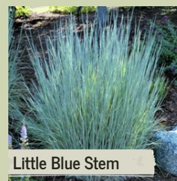
Little Blue Stem