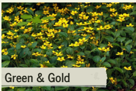
Green & Gold